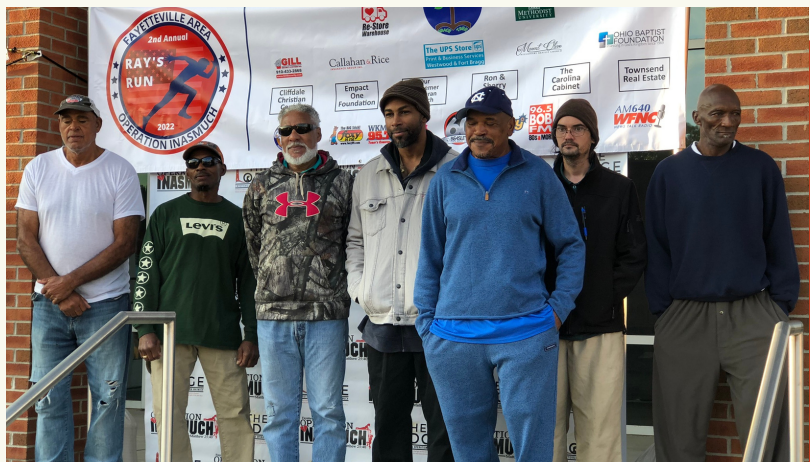
MEN FROM THE LODGE AT RAY'S RUN