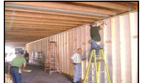
Tireless volunteers frame on & on & on