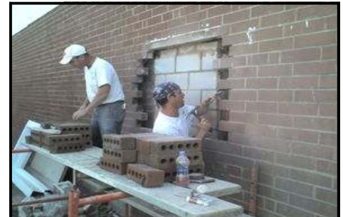
A door becomes a wall