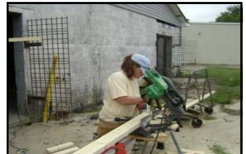
Sometimes the workmen are women