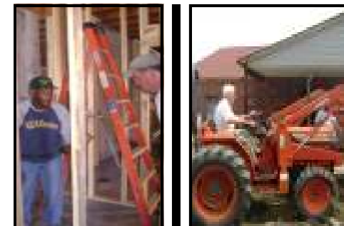
Measure Twice-Cut Once