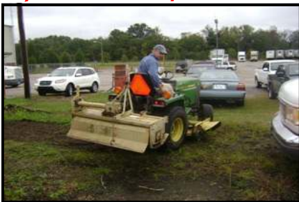
First we'll till and then we'll plant!