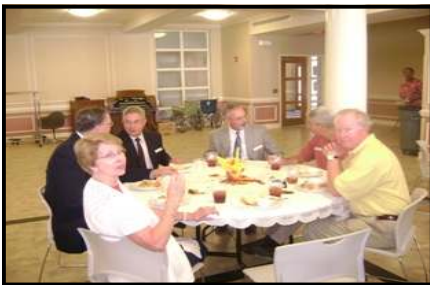
JfL luncheon at Hay St. Methodist

If you would like to receive The Mission by email only, please visit our website: www.faoiam.org