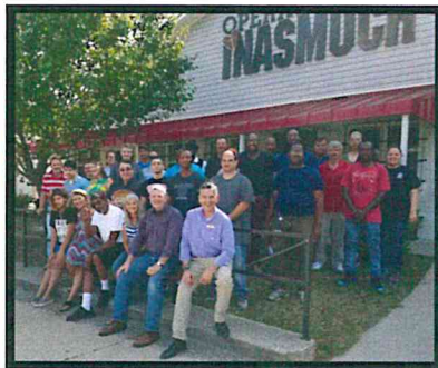
TLAA Fiesta Feast gathering

If you are interested in being a part of TLA A as a Volunteer and/or provide a meal for one of this year's social events, please contact: