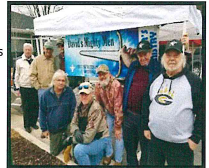
Thank you, David's Mighty Men, of First Presbyterian for sponsoring a cookout!

The Lodge Alumni Association ("TLAA") was formed to connect Lodge graduates and men who are currently in the program. No one can tell the story of breaking the cycle of homelessness better than our men who battled for the life God intended. Lodge graduates hold leadership roles in the Association and plan quarterly cookout gatherings sponsored by our generous volunteers and supporters.