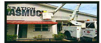
SPRUCING UP OUR NAME!

Bank of America St. Patrick's Catholic Church