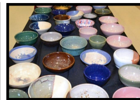
Thank you Bread ‘n Bowls volunteers! The bowls of Bread ‘n Bowls!