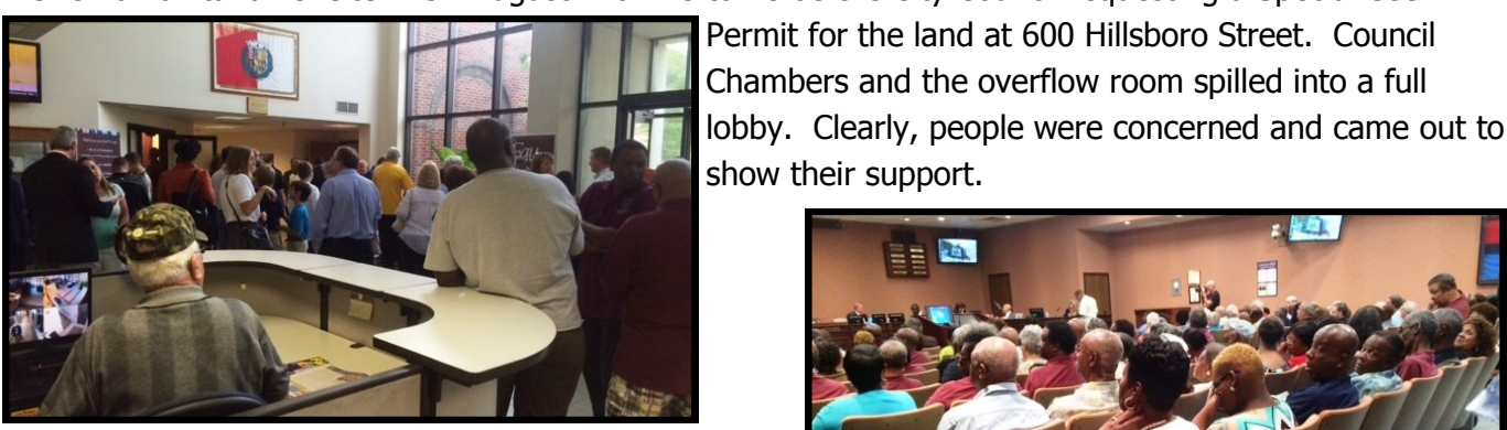
The overflow room was filled to capacity and spilled into the lobby

After years of seeing the desperate need for more beds in our city we began the quest to build a 40 bed men's humanitarian shelter. On August 24th we came before City Council requesting a Special Use