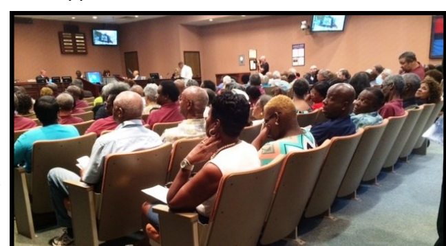
Every seat was full in Council Chambers!

This emotionally charged issue brought forth dozens of pro and con speakers. After over three hours of speakers, the City Council felt they had "more questions than answers"; questions too great for them to