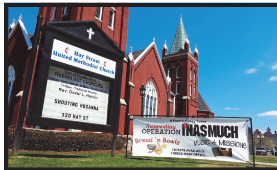
Historic host Church, Hay Street United Methodist