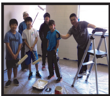
Church of the Apostles & Korean Presbyterian volunteered at Cumberland Community Foundation

The thank you notes and phone calls from Directors to Board Members of these nonprofits has affirmed our decision to choose them as our '2013 Neighborhood'.