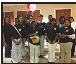
Volunteers from AKA Emerging Young Leaders