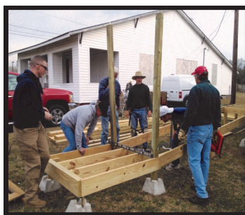
St. Andrews UMC built a wheelchair ramp at Open Arms Christian Fellowship