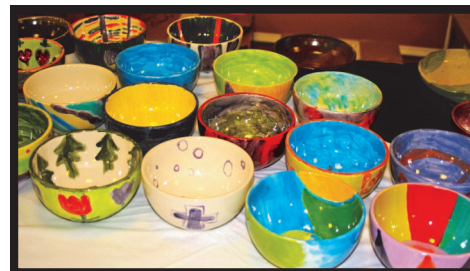
Pottery Bowls hand painted by the Family