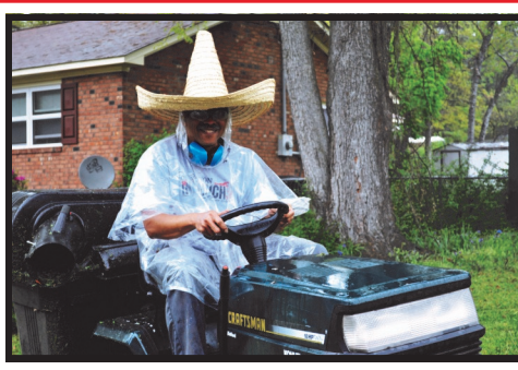
Rain? What Rain? It's Blitz Day!

St Andrews UMC St. Elizabeth Ann Seton St John's Episcopal St. Michael's Catholic St. Pauls in the Pines Temple Baptist The River Village Baptist Westminster Presbyterian