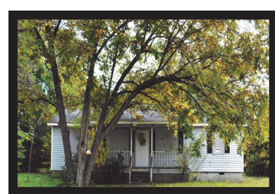
602 Frink Street