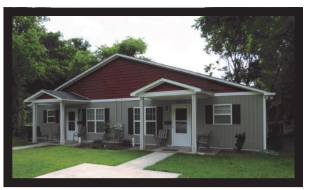
604-606 Frink Street