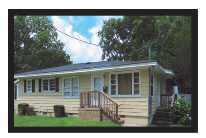
601 Frink Street