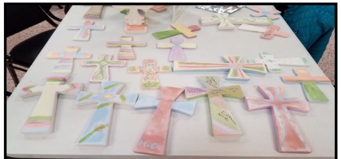
Crosses painted by our Family Members will be for sale, too!