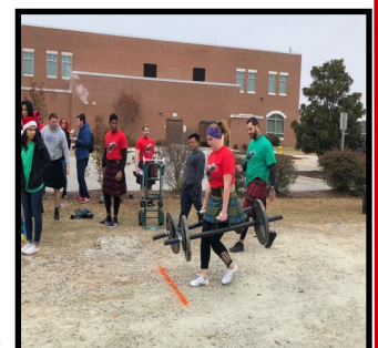
Walking with barbells