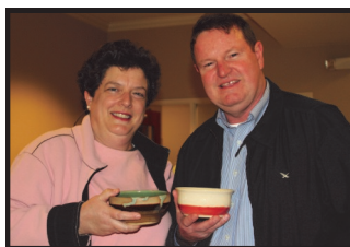
A bowl for you, a bowl for me!