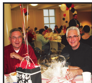
Full tummies & happy faces