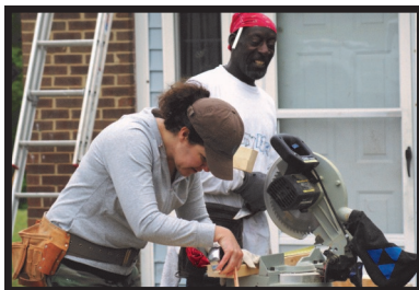
Measure twice, cut once