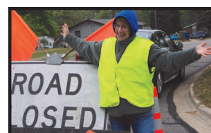
Not Down This Street!