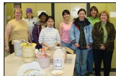
FTCC Pottery Students