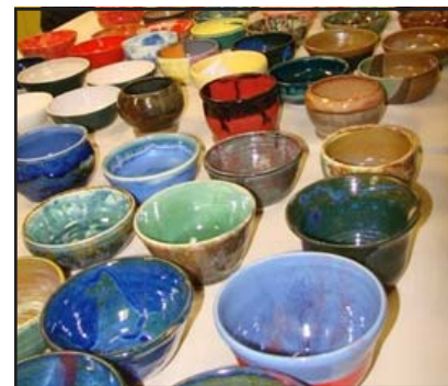
February 27th at Hay St. UMC.

The average cost to provide one meal is $1.50; we raised almost $12,000. which allows us to feed 7800 meals to those who join us for breakfast at 531 Hillsboro Street.