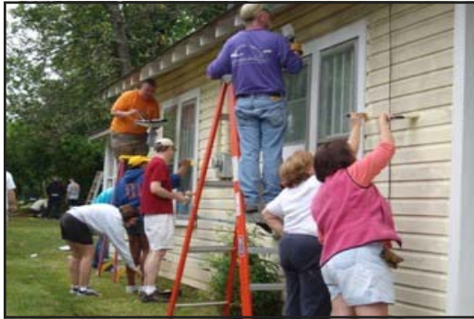
April 30th, 2009 - Law Day