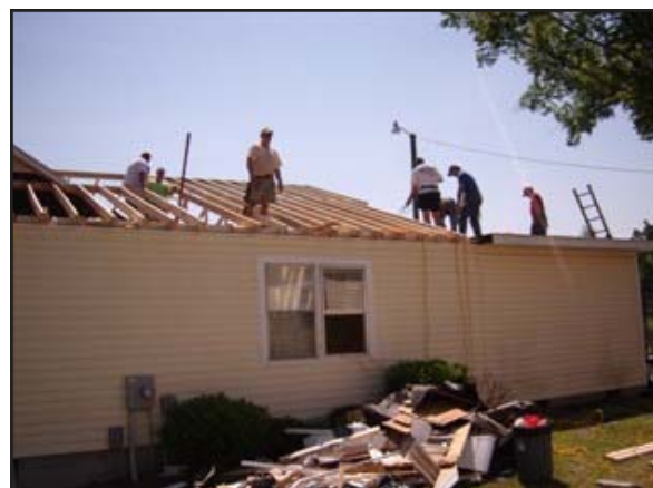
April 25th, 2009 - Angels On The Roof!

An improved roof structure was built for Save The Babies House Of Refuge , a valuable, life changing ministry that provides a home for expectant teenage Moms in crisis.