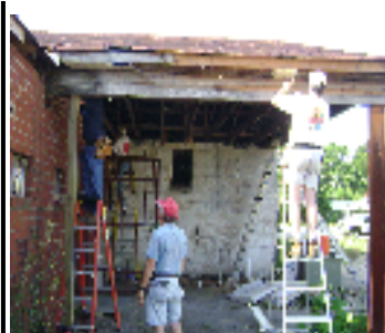
Snyder guys working on the back entrance.

With unwavering faith and dedication to the cause, volunteers provide their time, tithes and talents.