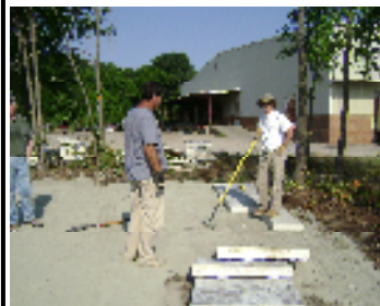
First Presbyterian place the first blocks for our Prayer Garden.

This unique combination of faith and expertise is resulting in a transformation that we pray will carry over into the lives of the people we will serve.