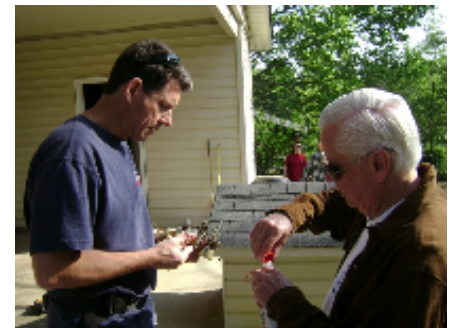
'Just A Few Drops & You'll Be A Silver Fox Too'

Shrubbery and trees were trimmed and a vine covered backyard was transformed into a neat, useable space. Inside the home, the living room walls were freshly painted and thanks to the generosity of the attorneys, new carpeting was installed. It is a special blessing to have lawyers and judges willing to step outside the courtroom and touch the heart of Cumberland County.