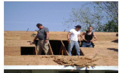
Lebanon Baptist & Open Arms Fellowship, A little closer to Heaven.