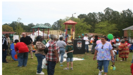
Neighborhood Block Party, where God's joy is contagious

A special attraction of Blitz Day was the neighborhood block party which drew children of all ages to the games, food and loving touch of Christian volunteers. This extraordinary venue captivated everyone with the joyful sound of music and laughter in the neighborhood.