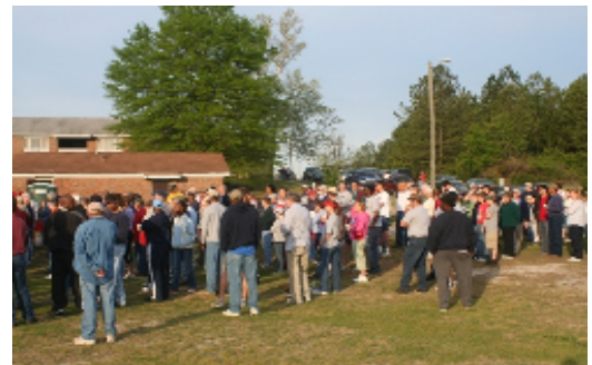
Morning Prayer, whenever two or more are gathered...